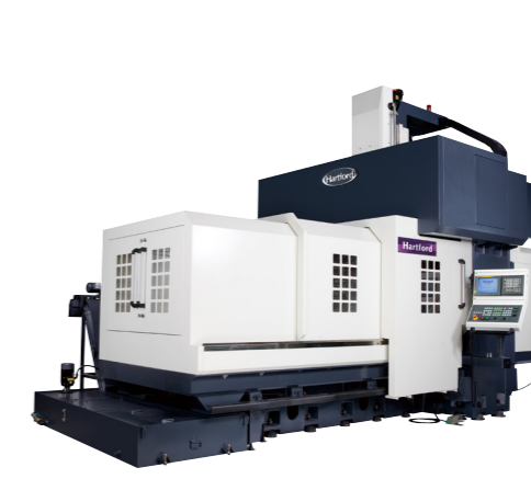
HARTFORD PRO 3150AG