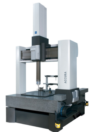
ZEISS ACCURA II