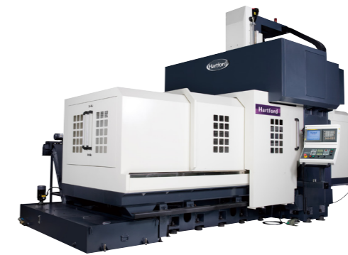
HARTFORD PRO 3150AG